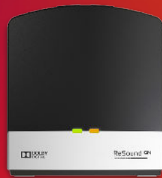
TV Streamer 2

* TV-Streamer+ is compatible with ReSound Vivia, ReSound Enzo IA, ReSound Savi and ReSound Nexia